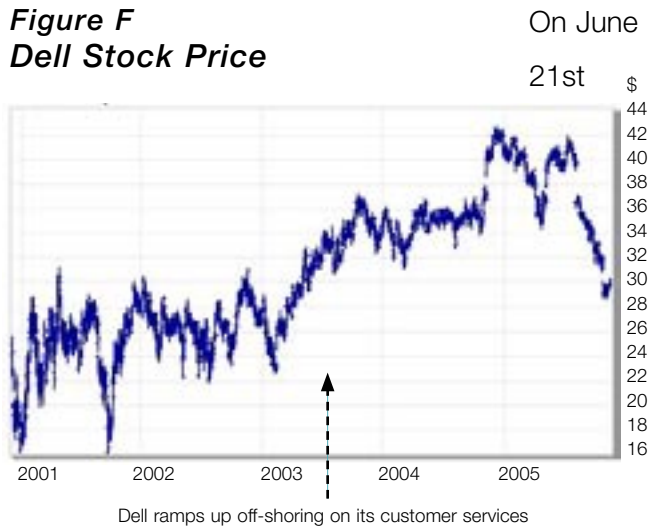
Figure F Dell Stock Price

2005, Jeff Jarvis drew attention to Dell's failure to repair his defective laptop at his house (as promised by his service agreement) in this blog post.